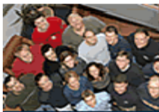
Labour Hire >>