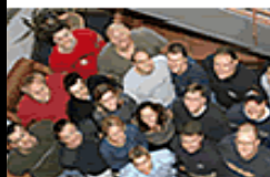
Labour Hire >>