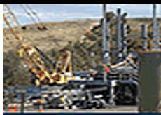
Technical Support >