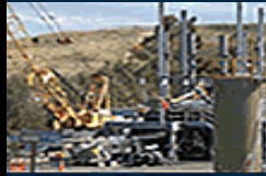
Technical Support >>