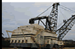
Project Management >>